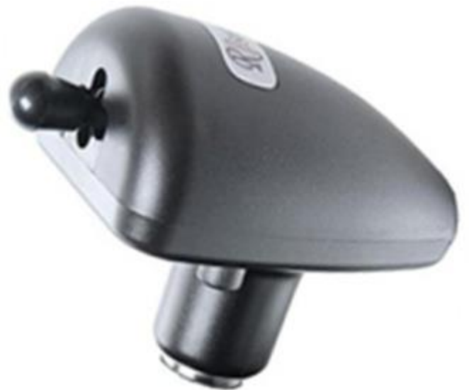
This image is the actual size of the Classic Joystick Spinner. L85mm W47mm D36mm (excl. neck & spindle)

With an RB Systems Classic Joystick Spinner installed the driver retains full control of the vehicle whilst safely operating required electrical functions - 100% of the time, even while negotiating roundabouts.