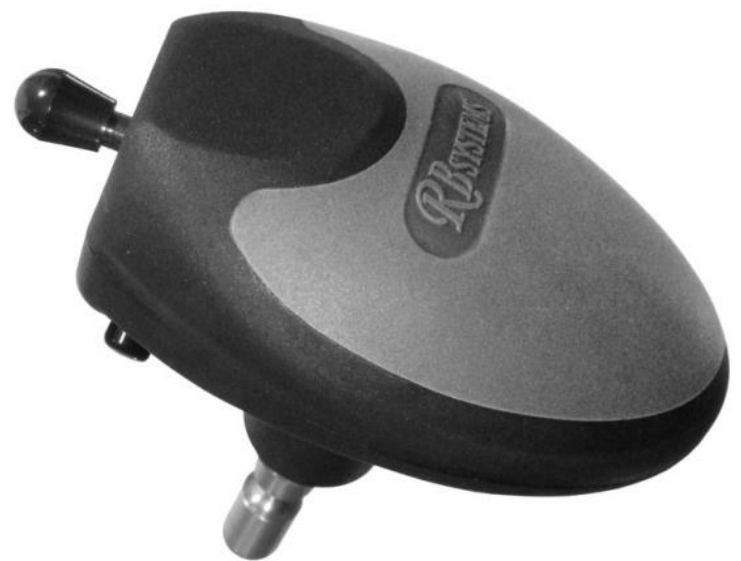
This image is the actual size of the Large Joystick Spinner L95mm W55mm D38mm (excl. neck & spindle)

With an RB Systems Large Joystick Spinner installed the driver retains full control of the vehicle whilst safely operating required electrical functions-100% of the time, even while negotiating roundabouts.